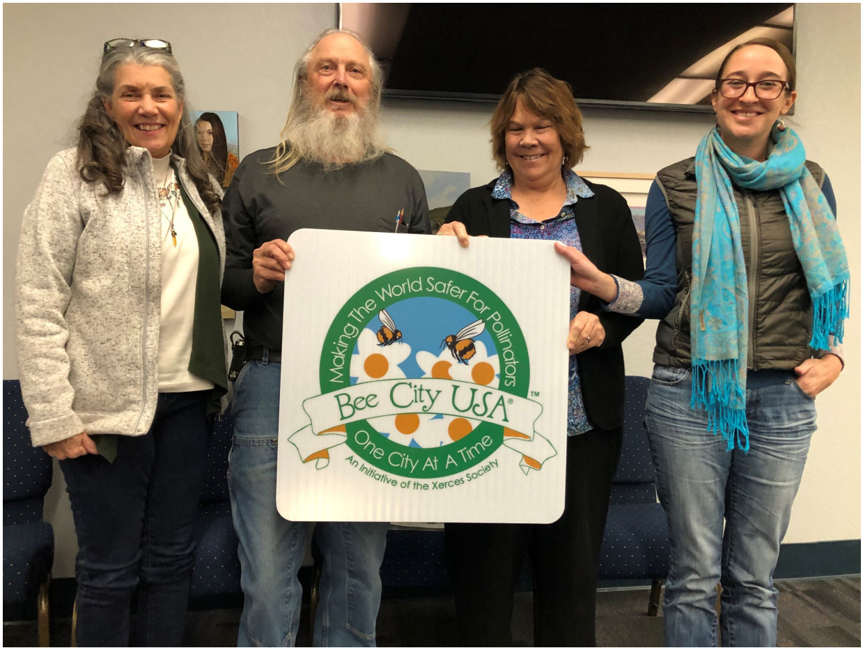
Bee City USA #76: 2020 Carson City Bee City USA #76 Committee.