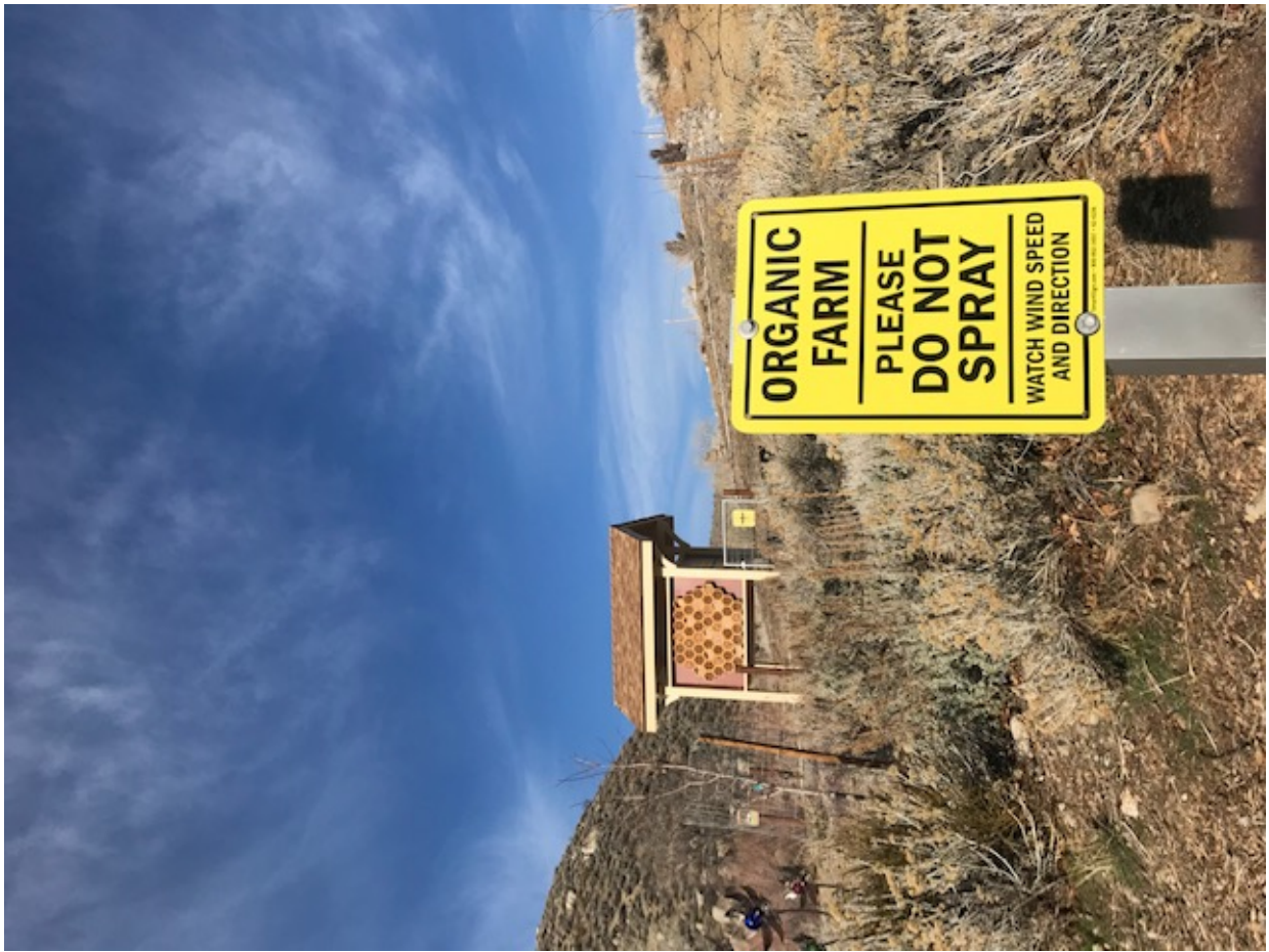
Bee City USA #76: Signage installed at the Foothill Garden - Bee Hotel and Pollinator Garden. This is an organic site and herbicides are not used.